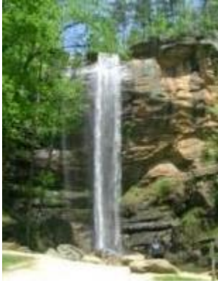
Toccoa Falls, GA