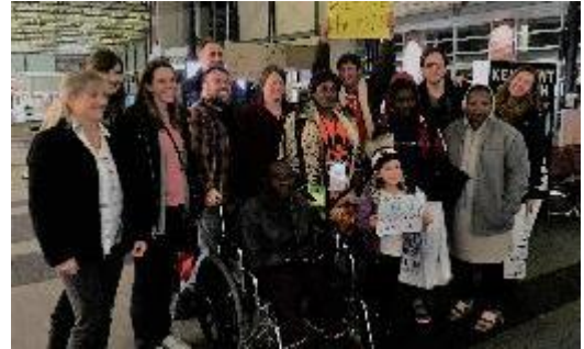
A Refugee Family Welcomed ‘Home’

As you can tell, we have stayed very busy, so many of the projects at home haven’t moved ahead as much as we would have liked, especially with travels to Tennessee for a graduation and Indiana for Christmas with Brad’s family. Now with the shorter days, we are hurrying to get some exterior projects completed in the few remaining mild days before cold weather really sets in; there is still a little painting that needs to be completed on the porch. Brad is chopping firewood almost daily to keep our fireplace going during the coldest days! One of our main goals during our time in the US is to get our adult kids settled well; they’ve all made good strides!