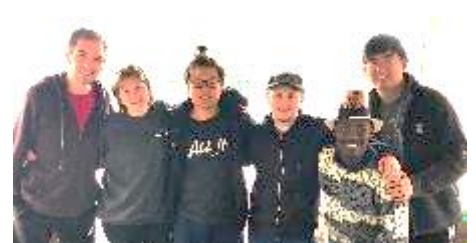
Ring in the New Year