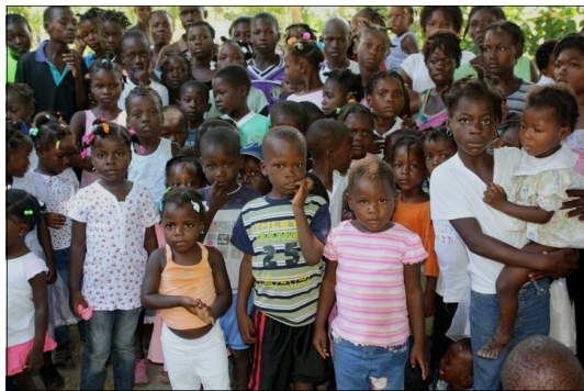
Haitian children in feeding program

-A feeding program for over 100 children in Haiti was started as an outreach of the Monte Cristi church. The children are fed two meals a week.