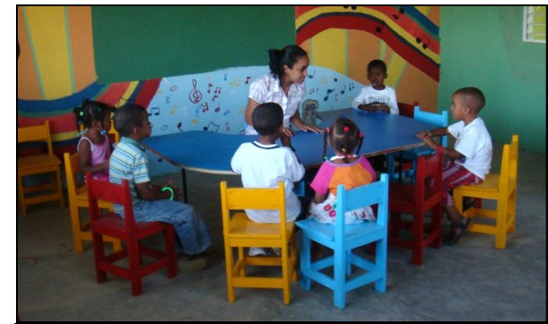
Preparations for new school continue with newly painted chairs and tables. Classes begin in August.

A generous donation has made it possible for the mission to dig a well by the baseball field. This will be so helpful, especially during the times when water is not available through the city (which can be for a couple of weeks at a time). After a dry first attempt, we anticipate the current hole will have to be over 400 feet deep to hit a sufficient water supply (we're halfway there!)