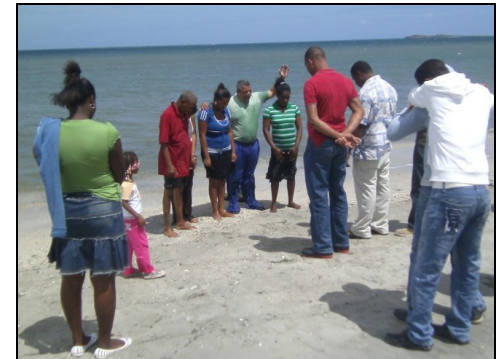
Baptism in the ocean at Monte Cristi