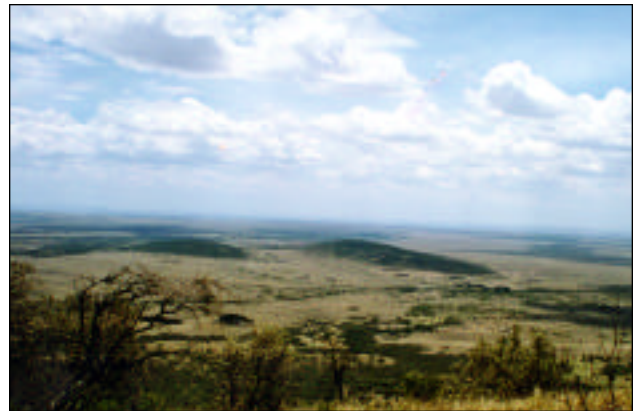
Endoinyo Erinka, the land we learned to call home.