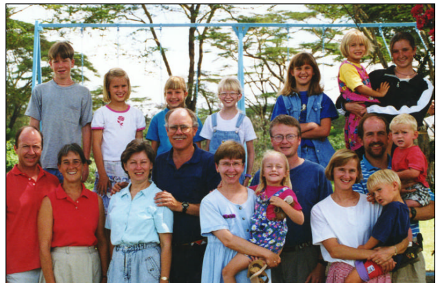
1999 CMF-Maasai team.

CMF missionaries ordained five elders and two young ministers in our local church, an exciting milestone in the life of the Maasai church at Endoinyo Erinka.