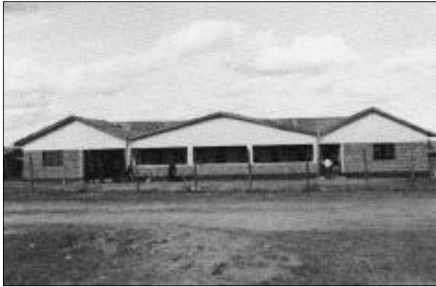
Ewaso Ng'iro Clinic.