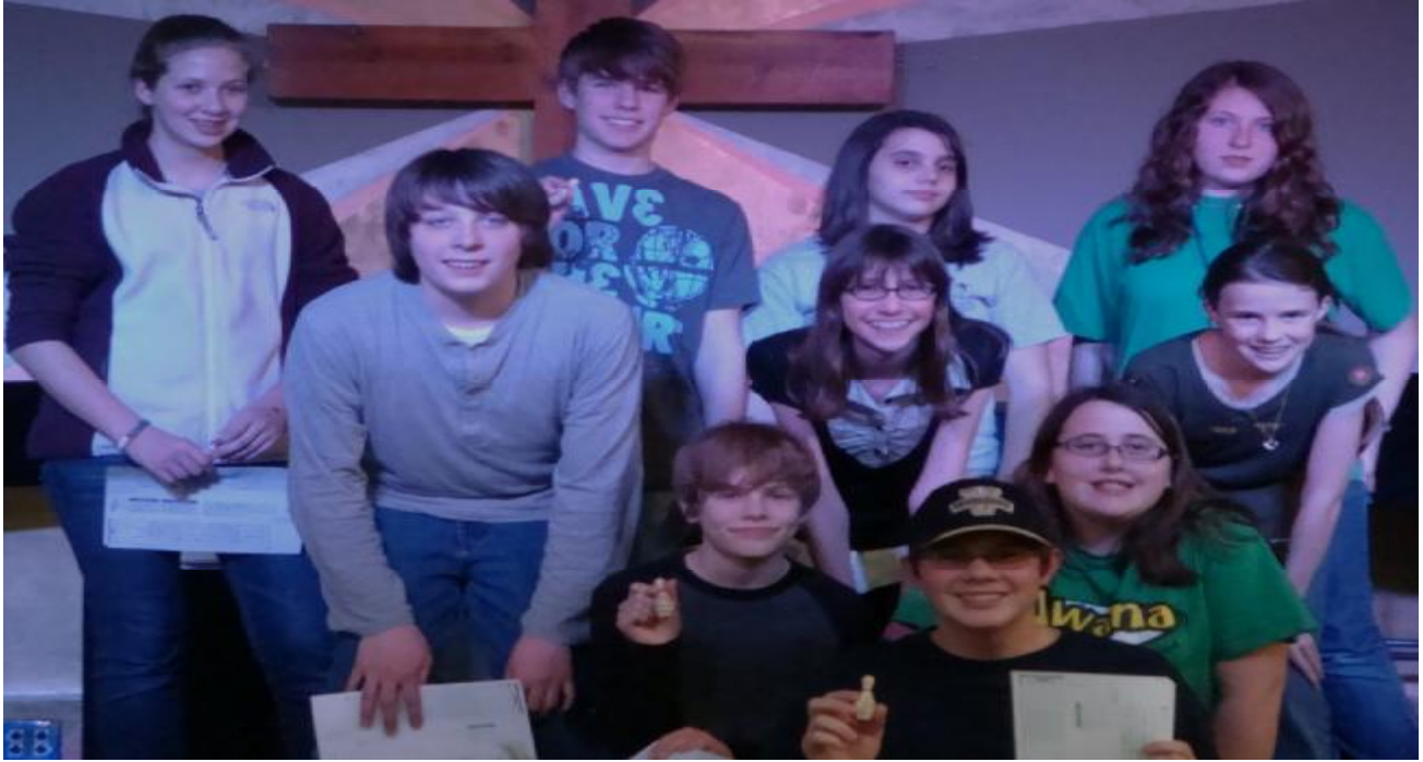
Top 10 Top Brains Junior Division