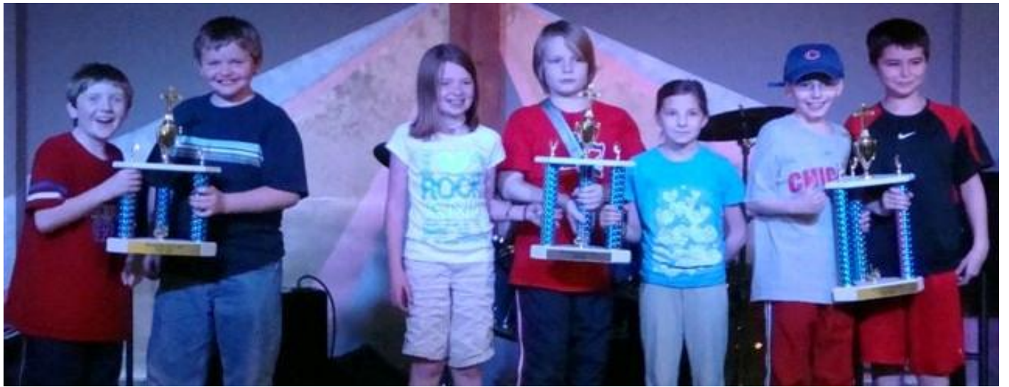
Beginner Bowler Winners