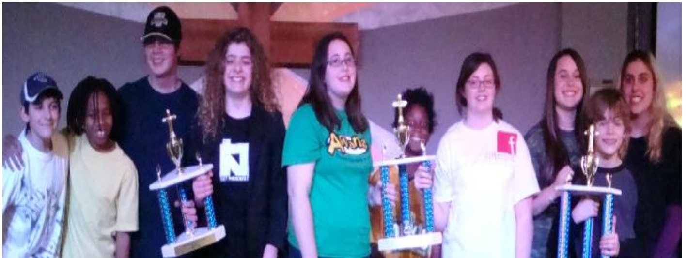
Division I Bible Bowl Winners