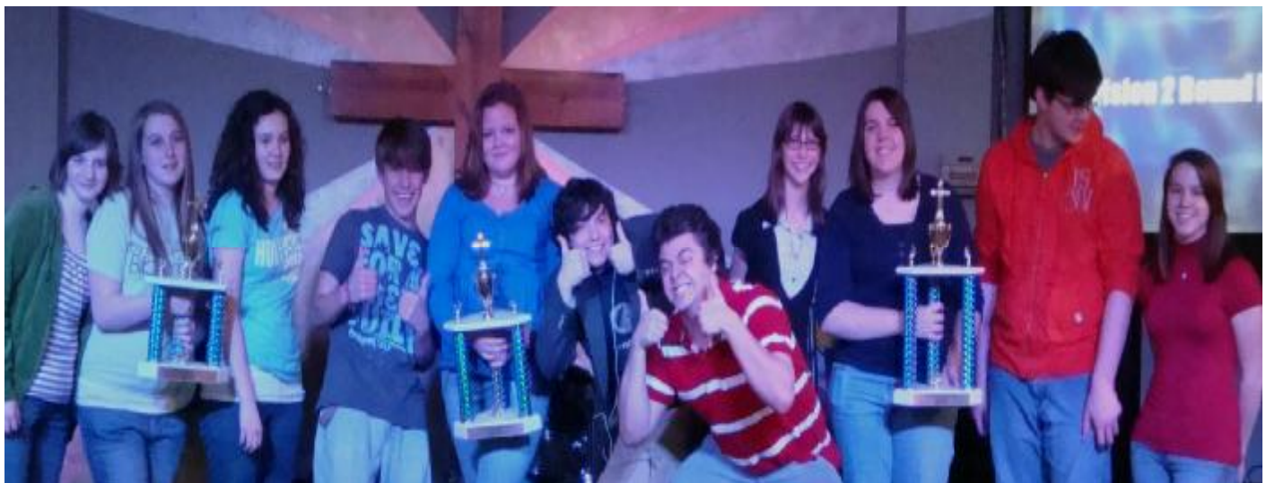
Division II Bible Bowl Winners