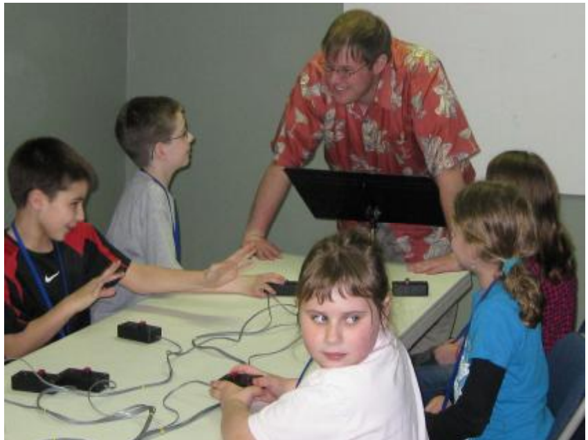
Beginner Bowlers having fun before a game.