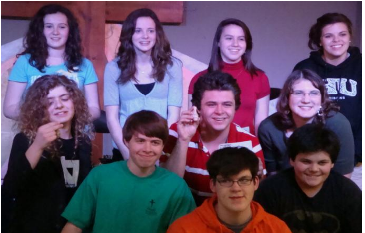
Top 10 Top Brains Senior Division