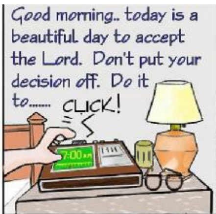
The Salvation Snooze Button

28 "Therefore I want you to know that God's salvation has been sent to the Gentiles, and they will listen!"