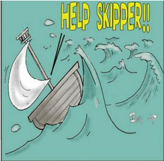
Acts 27.. Paul sails for Rome, but the ship gets caught up in a 'Northeaster' If not for the courage of the fearless crew the Minnow would be lost..