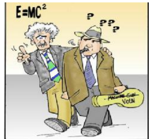
Natural man understanding spiritual matters without God's spirit leading is like Albert Einstein tutoring Al Capone on science. 1 Cor 2:12-16

28 "Therefore I want you to know that God's salvation has been sent to the Gentiles, and they will listen!"